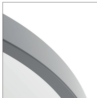
OP opal diffuser