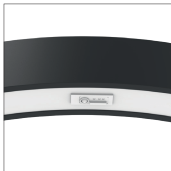
XC daylight&occ sensor

All current index numbers, lumen outputs, power consumption and many other technical information are available in our 2024 pricelist. Details on wireless lighting control systems on page number 896.